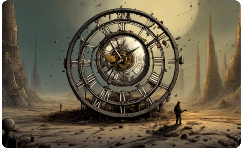
"Broken clock or blocked time?", by FiJRosa, CC-BY-NC-SA 3.0

Apocalyptica is CAPAS' international, interdisciplinary, open-access, double-blind, peer-reviewed academic journal. For this special issue, we are seeking submissions that explore the temporal aspects of apocalyptic biopolitics. We are looking for contributions that engage with critical moments of undoing or unveiling pervasive conceptions of time. More Info